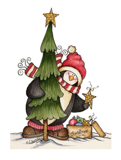
ALIVE with the Family