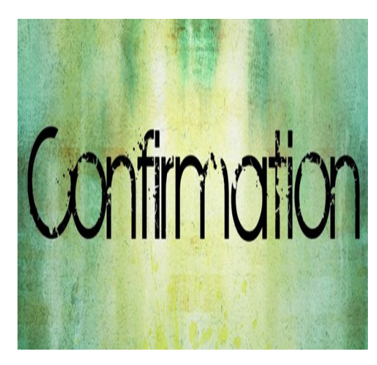
7th & 8th graders

NO Classes on Wed, Dec 25th or on Wed, Jan 1st Classes resume Wednesday, January 8, 2025 at 5:15 pm